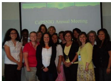
2008, Toronto, ON