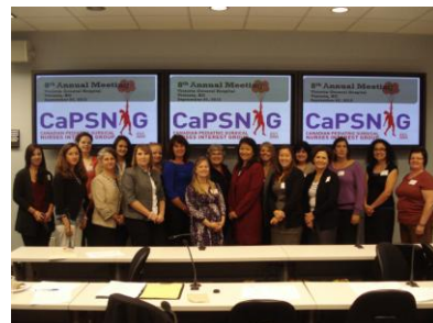
Victoria B.C. 2012