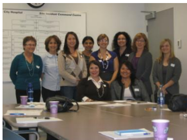
Saskatoon, SK. 2010