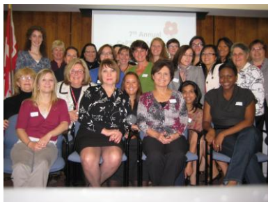
Ottawa, ON. 2011