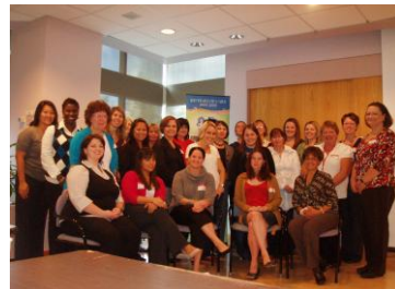
Halifax, NS. 2009